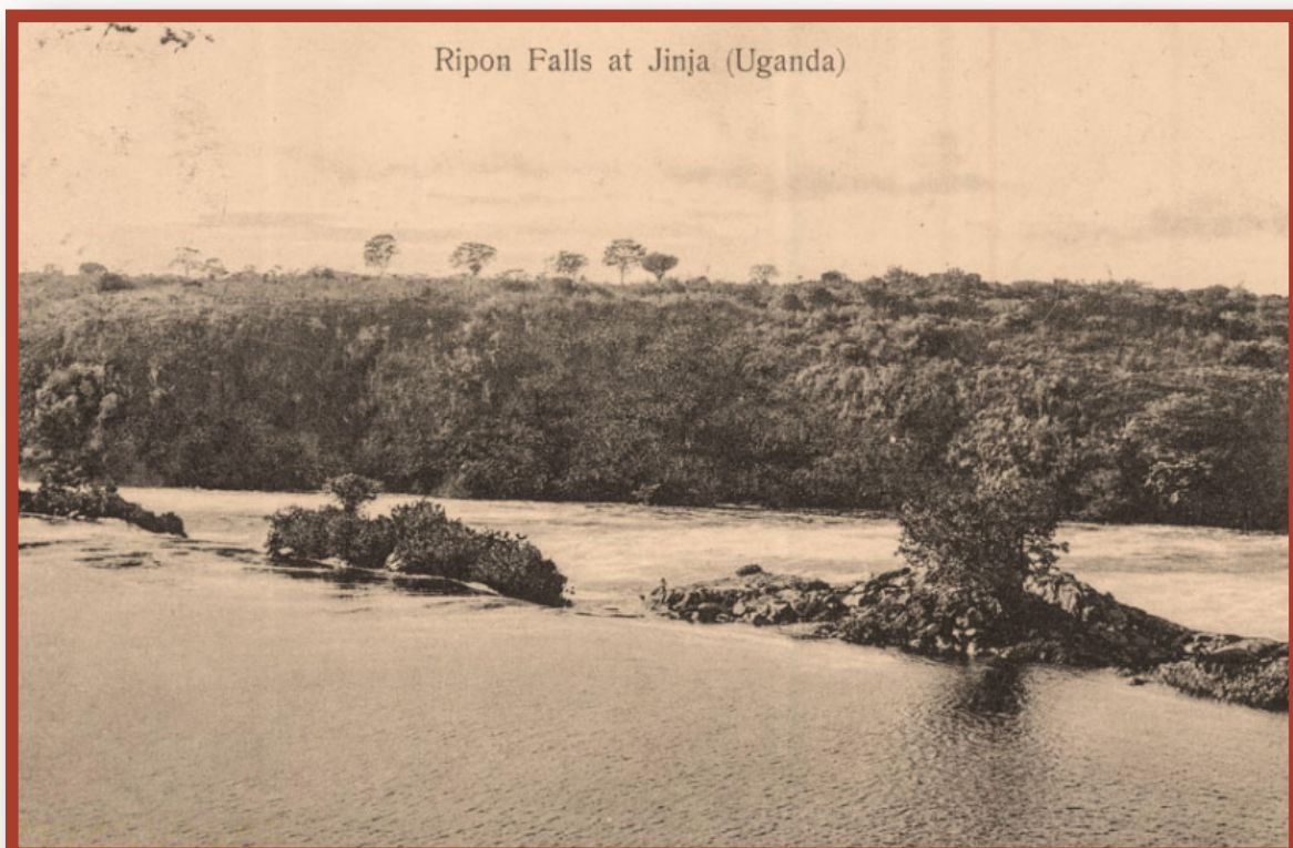
Ripon Falls at Jinja (Uganda)

Well before the advent of the colonial period, Jinja was a fishing village that benefited from being located on long-distance trade routes. The origin of the name "Jinja" probably comes from the word "rock" in the language of the Basoga and the Baganda who live on either side of the River Nile in the area, referring to the fact that the river could be crossed easily in this location thanks to the large rocks near the Ripon Falls (now flooded by the construction of the Owen Falls dam). It is also said that the central hill (site of the District Commissioner's residence in colonial times), acquired the name Jinja because of the rocky outcrop that can still be seen today. It was believed that the spirit of the hill could be appeased by sacrificing goats and chicken there.